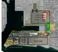
Expanded Terminal Footprint